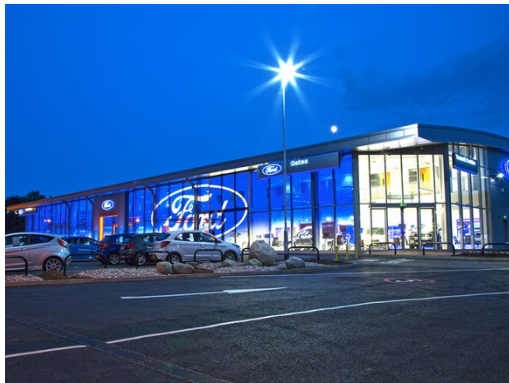
2018 non-residential winner Gates Ford

Our foundation sponsor is Places for People and our annual sponsor is Architecture and Design Services. They help us both financially and by sharing their specialist knowledge in architecture and planning.