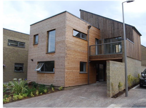
2018 residential winner 4 Forebury Lane, Newhall

Harlow Architectural Design Awards, organised by Harlow Civic Society, aims to encourage architects, developers and property owners to make Harlow an even better and more beautiful place in which to live. The winners receive prestigious trophies at a presentation event in the Autumn.