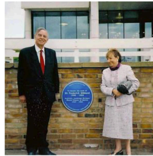
Unveiling the plaque for Sir Frederick Gibberd

About Harlow Civic Society from our website